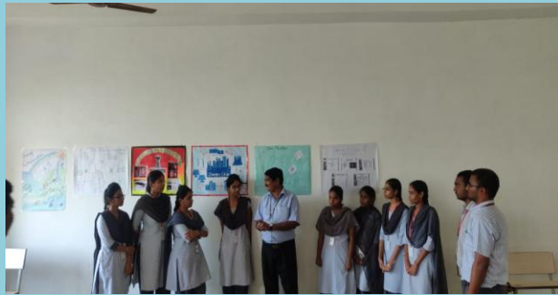
Discussion with guest