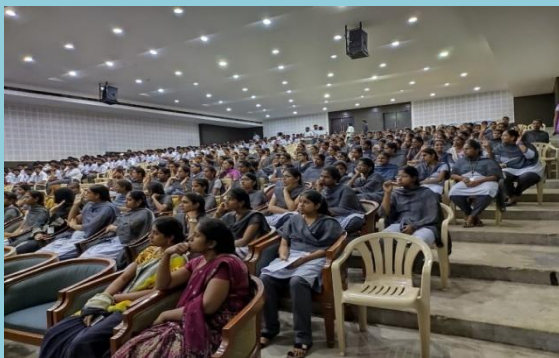
Students and Staff