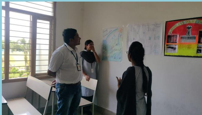
IV year student presentation