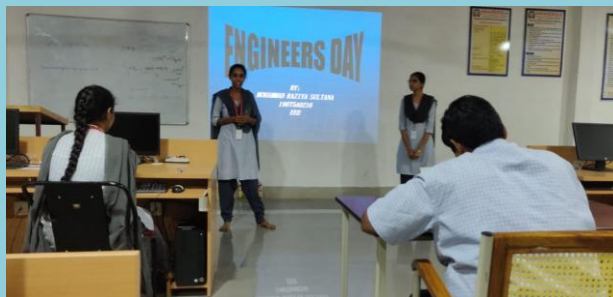
II year students presentation