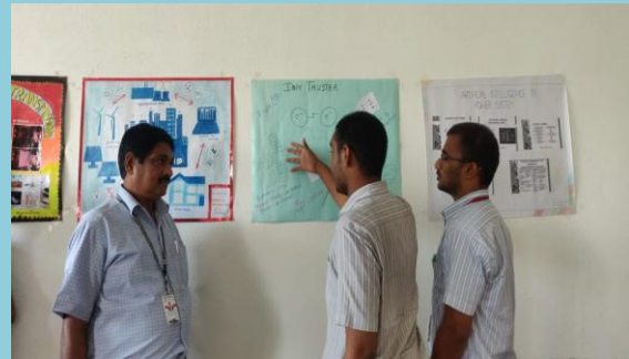
Explaining to the guest