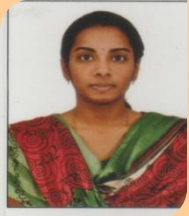
Ch.Kanchana 148T1A04B9 87.33%