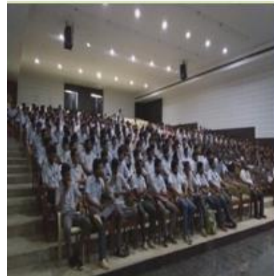
Impact of Infrastructure Reforms in Economic Development of Sunrise State A.P.