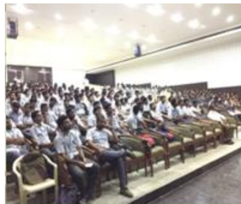
Remote Sensing and GIS Applications in Water Resources Management